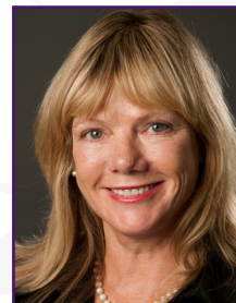
Catherine A. Brown Distinguished Service in Legal Scholarship

January 28, 2011 Fairmont Hotel Macdonald Edmonton, Alberta 11:30 a.m. - 1:30 p.m.